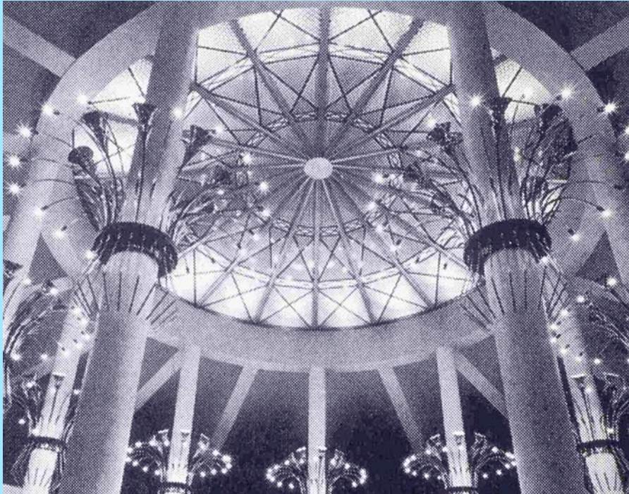
International Inn, Tampa, 1959