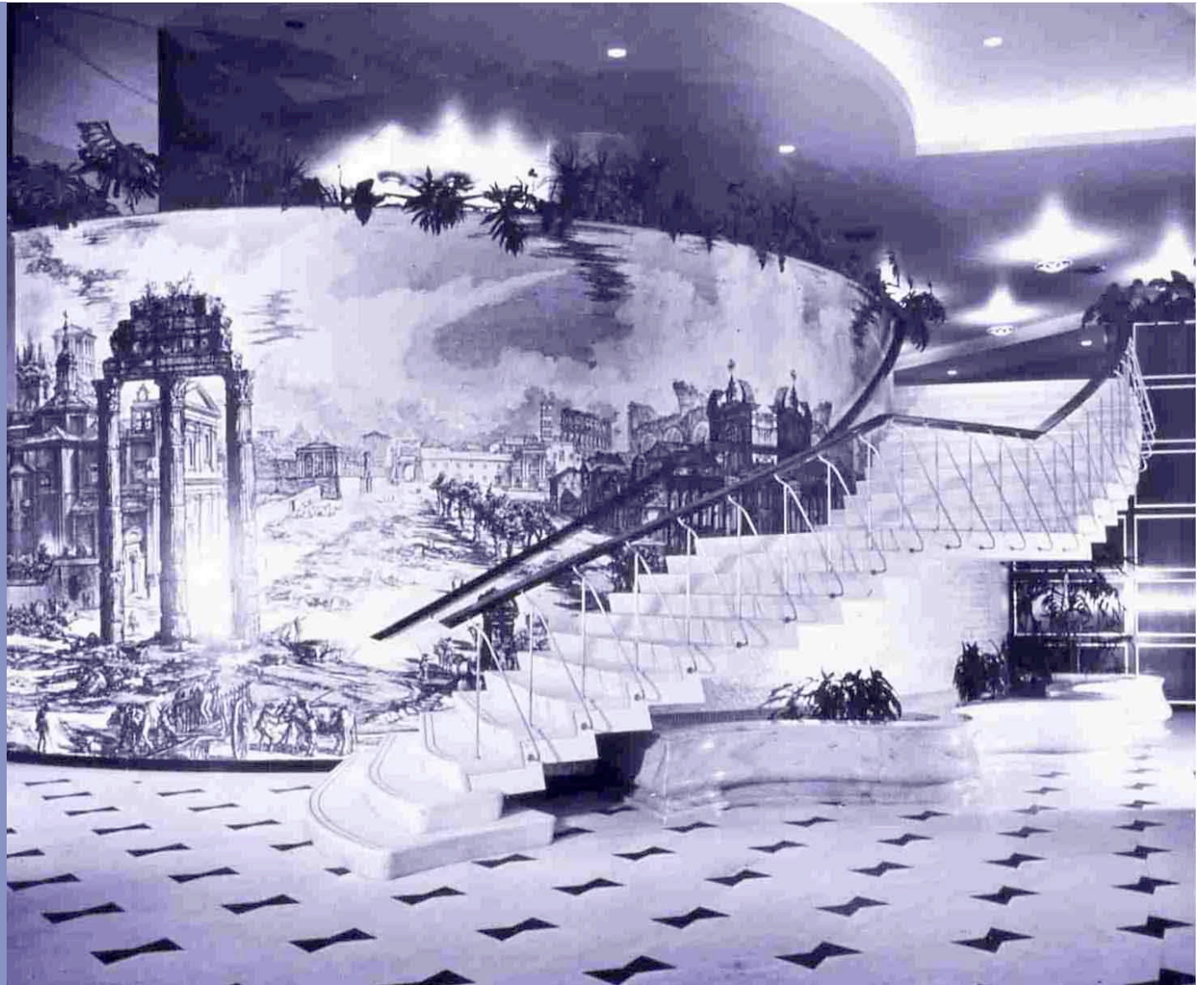
Fontainebleau famous "floating staircase", Miami Beach, 1954

His signature forms - chevrons, "bearpoles," "woggles," or amoeba shapes, and curving walls and ceilings punctuated by "cheese holes," or cutouts - have become treasured icons of American postwar vernacular architecture. Lapidus has described his work as a banquet of delight and joy.